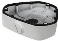
DS-1281ZJ-DM25 Inclined Ceiling Mount