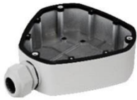
DS-1280ZJ-DM25 Junction Box