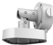
DS-1283ZJ Wall Mount (3-axis Adjustment)